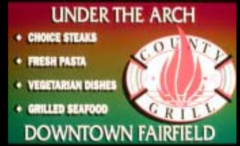
County Grill 3999 1 of 1 - Silver