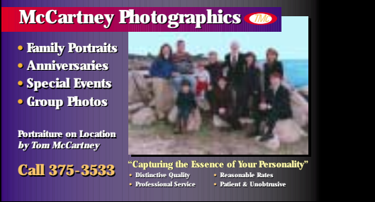
McCartney Photo 4419 1 of 1 - Silver