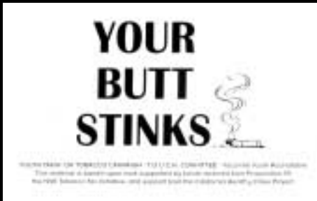
Anti-Tobacco Campaign 4441 1 of 1 - Silver