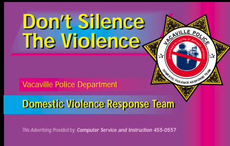
Vacaville Police 4335 1 of 1 - Silver