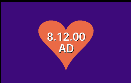
Marry Me? 4486 1 of 2 - Silver