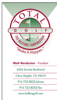
4448Balfore — Business Card Design