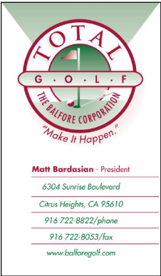
4448Balfore – Business Card Design