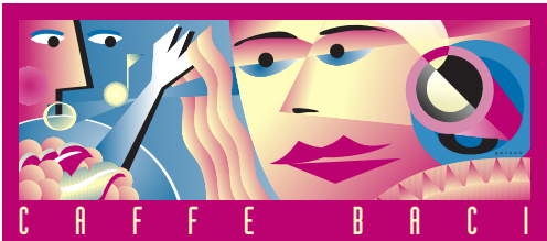
4377CaffèBaci – Logo Design