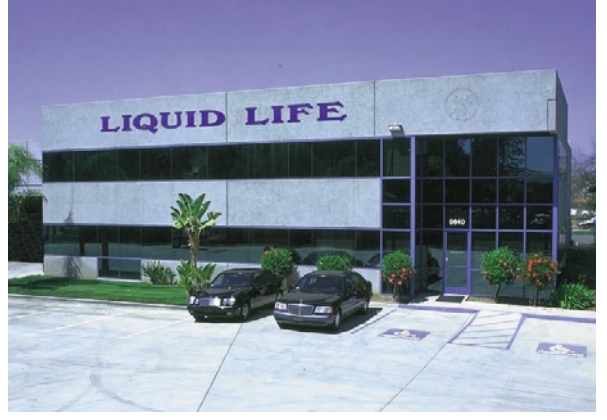
Liquid Life Distribution Headquarters